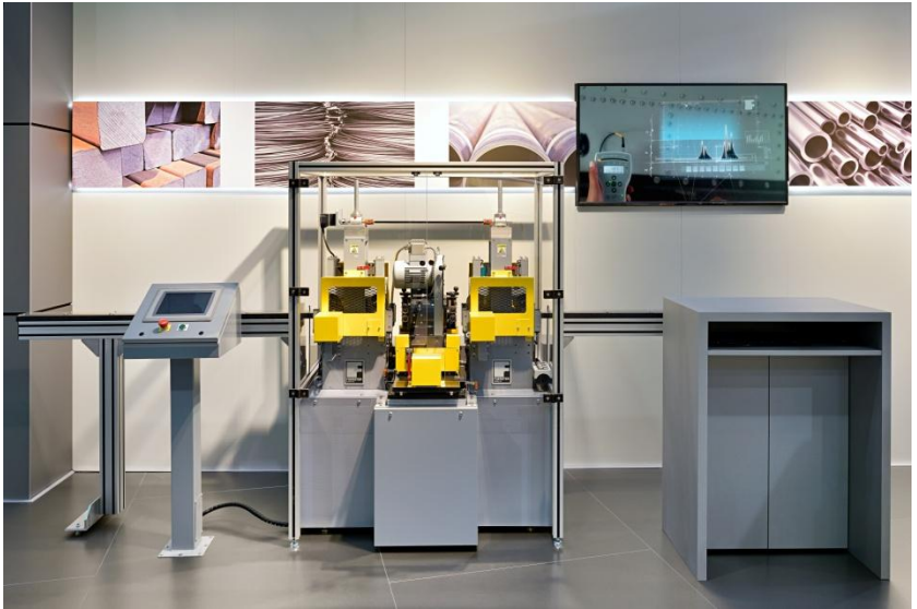
Figure 5: Automated test section