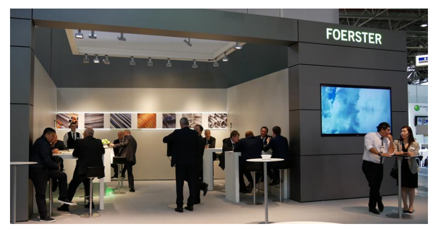
Figure 1: FOERSTER booth at Tube & wire 2018