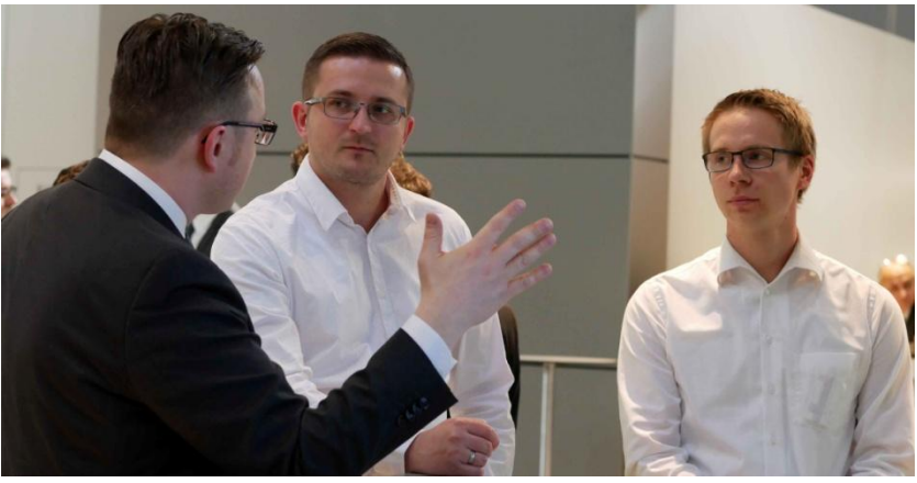
Figure 6: Many interesting discussions with customers took place