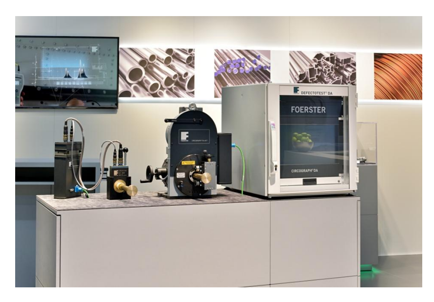
Figure 2: Introducing the new CIRCOGRAPH DA with the rotating head Ro 20 F for fast applications