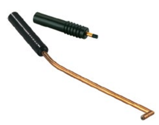
Eddy current probes